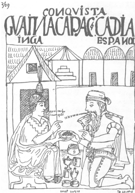
Fig. 2. Conquista. Meeting of Spaniard and Inca. The Inca says in Quechua, "You eat this gold?" Spaniard replies in Spanish, "We eat this gold."

The second half of the epistle continues the critique. It is titled Buen gobierno y justicia 'Good Government and Justice' and combines a description of colonial society in the Andean region with a passionate denunciation of Spanish exploitation and abuse. (These, at the time he was writing, were decimating the population of the Andes at a genocidal rate. In fact, the potential loss of the labor force became a main cause for reform of the system.) Guaman Poma's most implacable hostility is invoked by