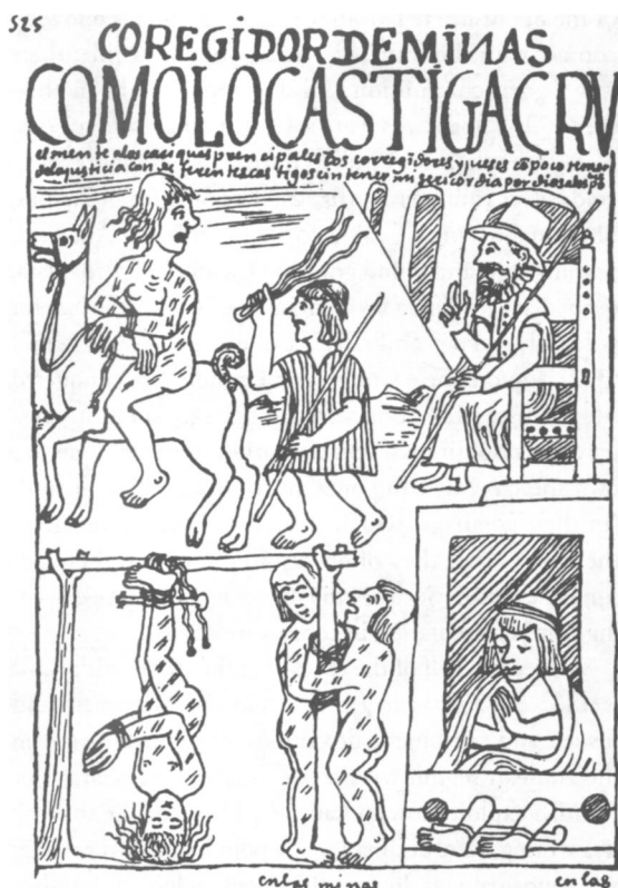
Fig. 3. Corregidor de minas. Catalog of Spanish abuses of indigenous labor force.